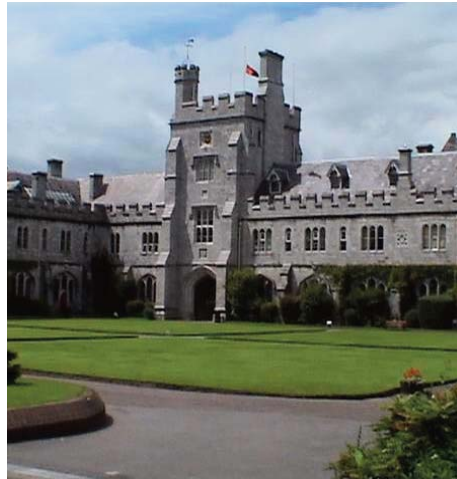
University College Cork

All applicants to PPRT Research Capacity schemes received full feedback on their application whether shortlisted or not and the Trust is happy to provide guidance to researchers on the application process.